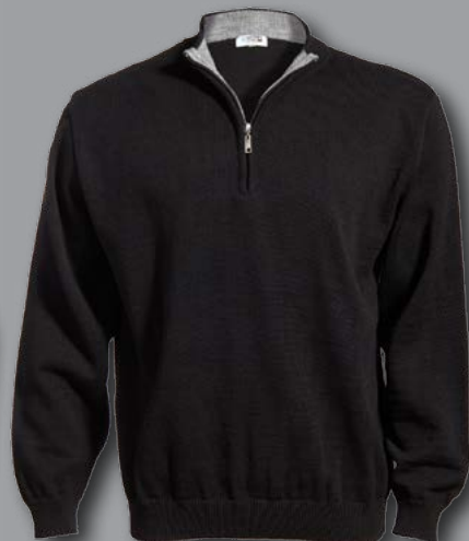
#4012/4052 Acrylic Quarter-Zip Vest/Sweater