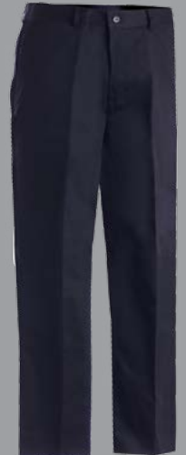
#2578/8576 Casual Chino Pants