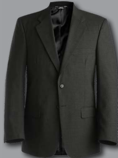
#3680/6680 Wool Blend Suit Coat