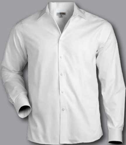
#1978/5978 Non-Iron Dress Shirt

Account Associate | Teller | Branch Sales Manager | Investment Manager