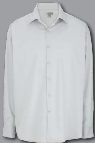
#1033/5033 Broadcloth Shirt

Account Associate | Teller | Branch Sales Manager | Investment Manager