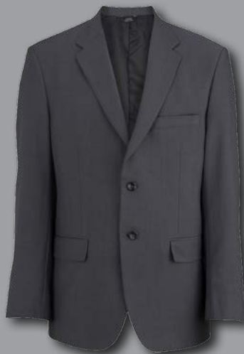
#3760/6760 Intaglio Microfiber Suit Coat