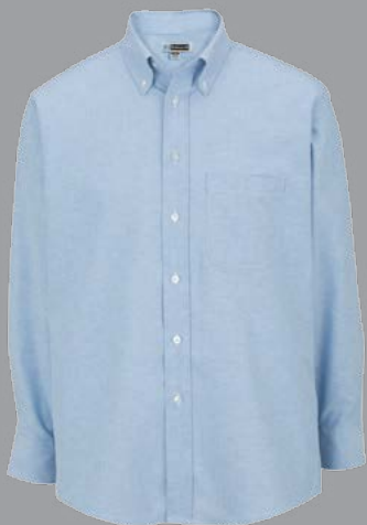
#1077/5077 Easy Care Oxford

Account Associate | Teller | Branch Sales Manager | Investment Manager