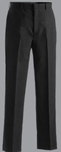
#2780/8783 Wool Blend Pants