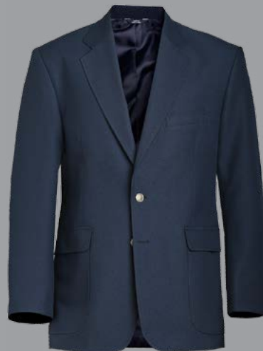
#3500/6500 Polyester Blazer