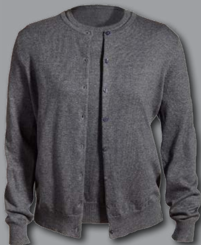
#038/4072 Twinset/Quarter-Zip Sweater