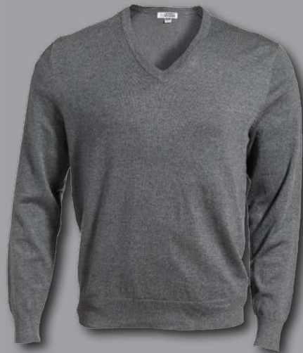
#4070/7056 V-Neck Sweater/Open Cardigan