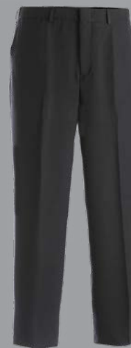
#2588/8760 Intaglio Microfiber Pants