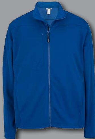
#3440/6440 Performance Tek™ Jacket