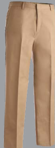
#2510/8519 Business Casual Chino Pants