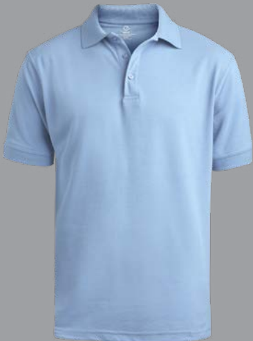
#1500/5500 Blended Pique Polo

Front Desk | Navigators | Business Associates | Administrators | Admissions | Director | Sales