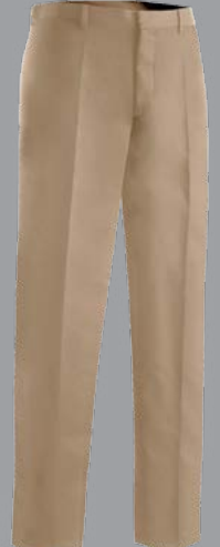
#2574/8572 Microfiber Dress Pants