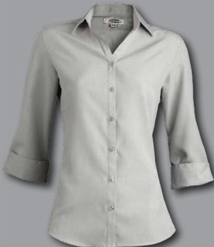
#1292/5292/5293 Batiste Shirt & Blouse