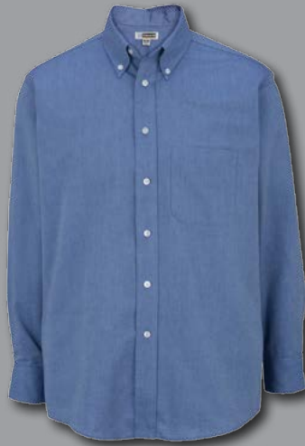
#1077/5077 Easy Care Oxford Shirts