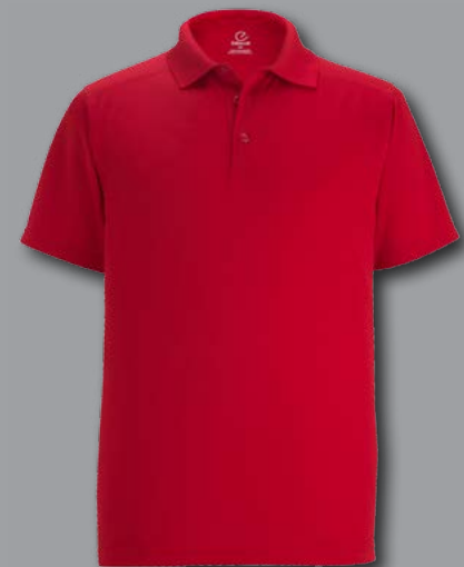
#1512/5512 Snag-Proof Polo

Front Desk | Navigators | Business Associates | Administrators | Admissions | Director | Sales