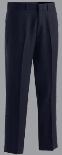
#2525/8525 Synergy™ Washable Pants