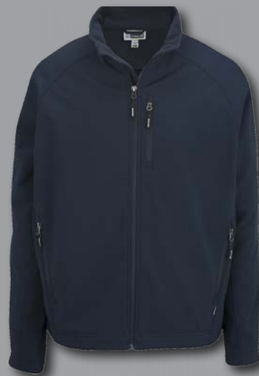
#3420/6420 Soft Shell Jacket