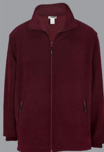
#3450/6450 Microfleece Jacket