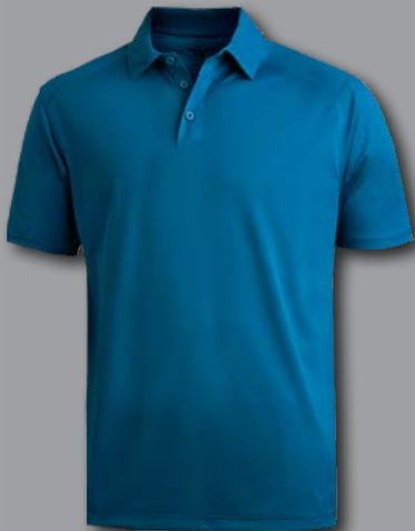
#1516/5516 Micro Pique Polo

Front Desk | Navigators | Business Associates | Administrators | Admissions | Director | Sales