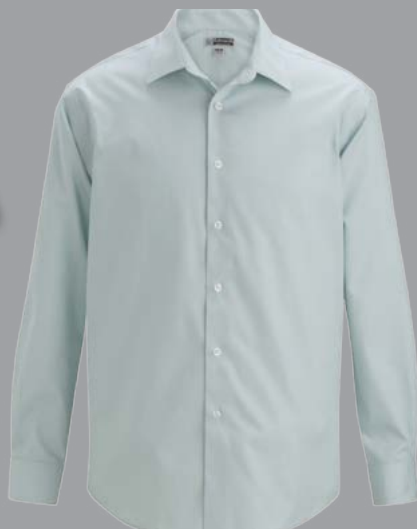
#1978/5978 Non-Iron Dress Shirt